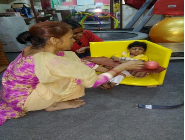
Using Adaptation (corner chair)