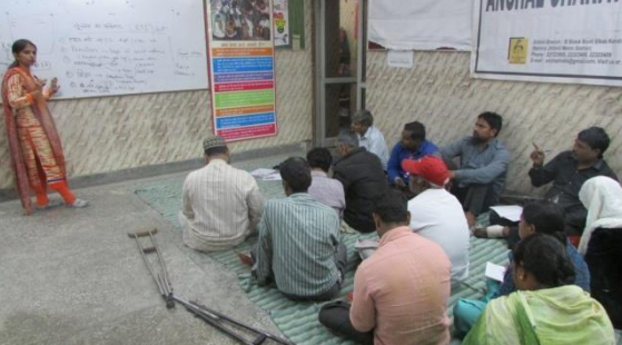
Training of Community Volunteers & Advocacy groups