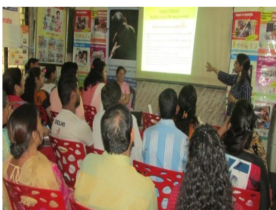
Parents Training Stakeholders Meet