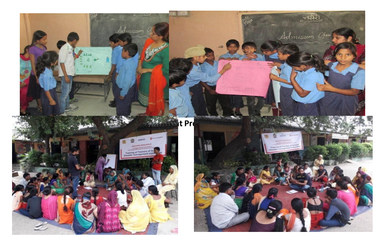
Training with key stakeholder & parents